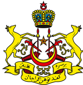
KERAJAAN NEGERI KELANTAN